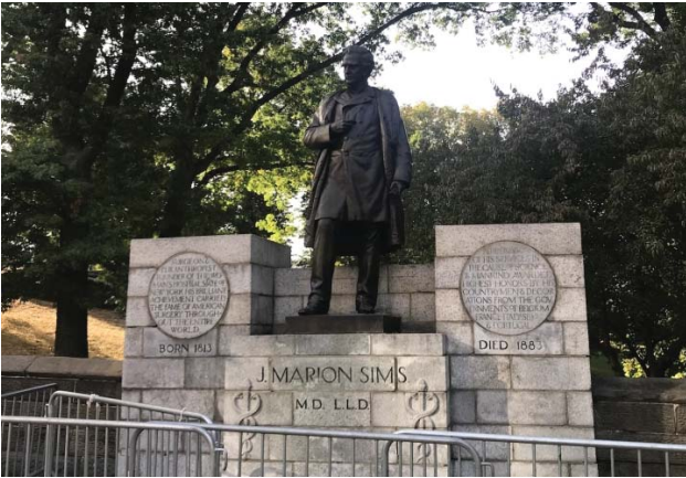
Statue of J. Marion Sims in Central Park

On Tuesday, November 28, the Mayoral Advisory Commission on City Art, Monuments, and Markers held its final public hearing for New Yorkers to voice their opposition to and support for the removal or reframing of public monuments around the city. Based on comments at the five public hearings and other feedback, the Commission is expected to make its recommendations to Mayor Bill de Blasio about how best to deal with contentious monuments by the end of the year.