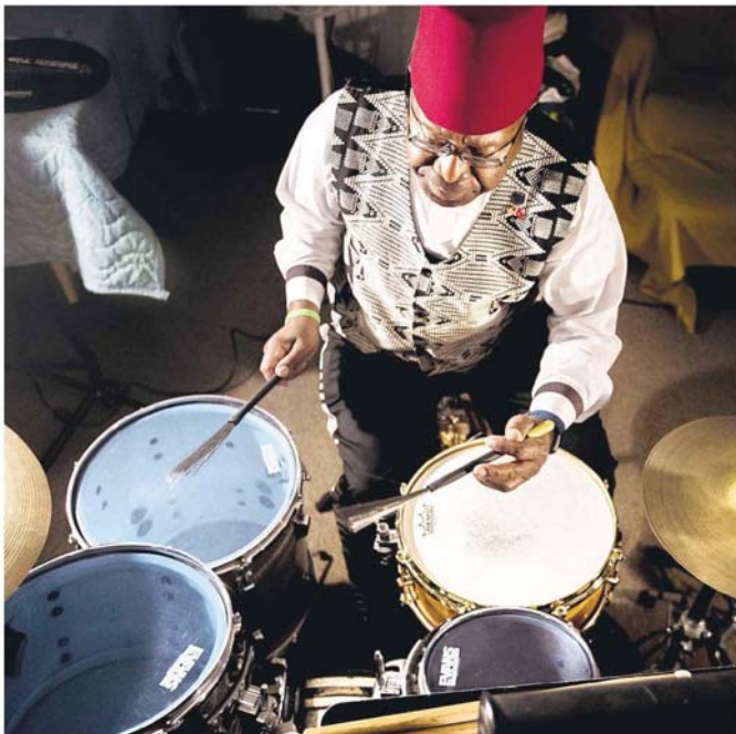
A longtime drummer, Revels-Bey teaches musical education to students in Long Island and New York City public schools.