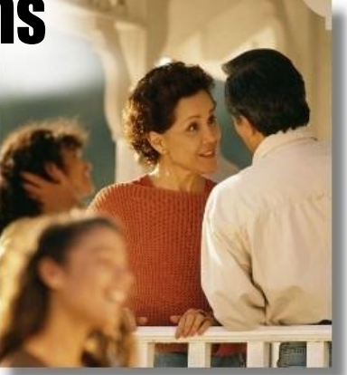
table. Try the following tips to help make your get-togethers a little merrier: 1) steer conversations that appear to be drifting into conflict toward those things you can agree on; 2) if you are angry about what's in the news, avoid displacing this tension onto loved ones; 3) challenge yourself to be a tension de-escalator, not an aggravator; and 4) rehearse how you might respond to conflict because doing so will dramatically improve your ability to act calmly while avoiding hair-trigger reflexes.

The annual Stress in America survey consistently reports strain among families caused by their ideological differences, and the holidays have a keen reputation for these conflicts, even at the dinner